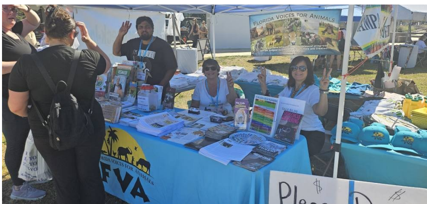
FVA Central at Tampa Bay Veg Fest, 11/08/2025