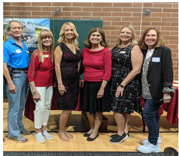
FVA Board at Have-A-Heart Fundraising Dinner & Silent Action held at Solid Rock Community School