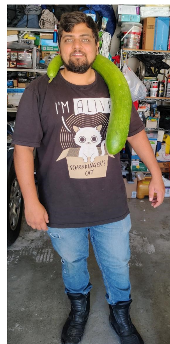
Nachi hooked on Veggies