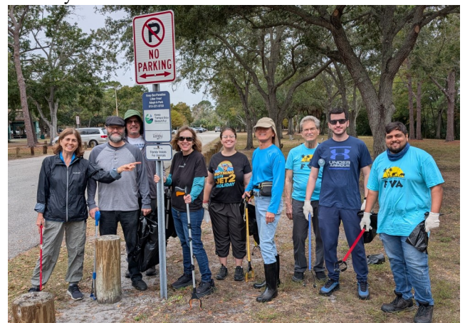
FVA Volunteers at Al Lopez Park Cleanup 12/7/2025

Please check our FVA Meetup calendar to join us at events like these and more so we can get to know each other. Finally, PLEASE support vegan restaurants in your area. Most need your support to survive these difficult times. If you can't dine in, order take out! We hope to see you soon!