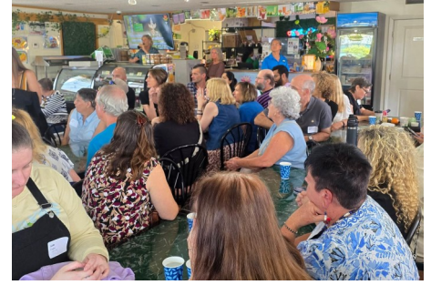
Attendees at Lotus Vegan