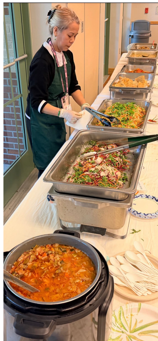
World Vegan Cuisine catered the event with a delicious buffet.